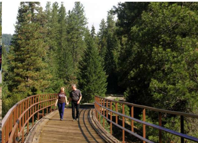
Pictured: Weiser River Trail

Weiser River Trail Fund: Created by Patricia Pontefract of Boise, this fund supports development of the Weiser River Trail.