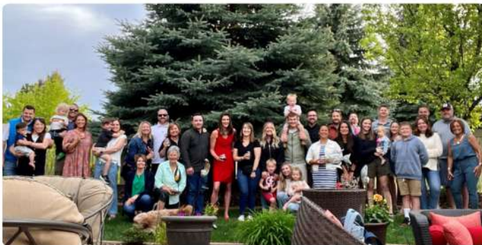
Pictured: The Greater Coeur D'Alene Community Foundation Backyard Bunch 2024