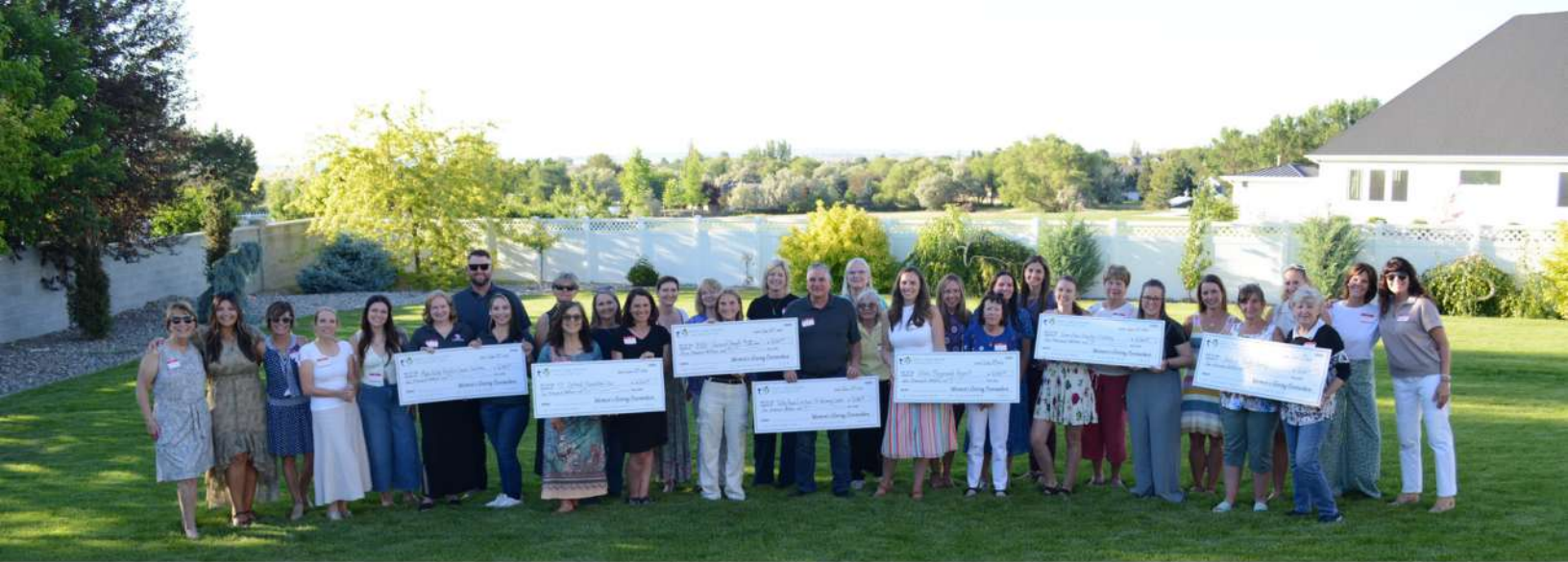
Pictured: The Women's Giving Connection of Southern Idaho, 2024 grants awards event.