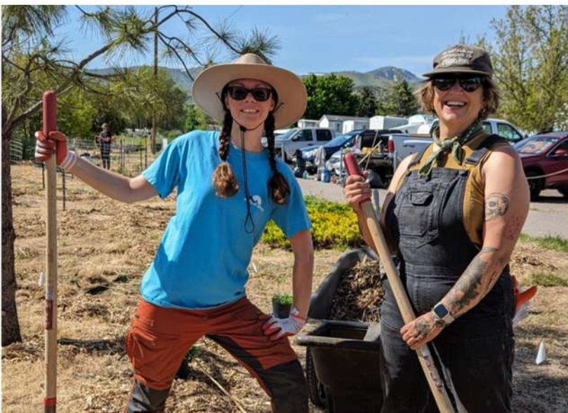
Pictured: Ifft Foundation Grant Recipient