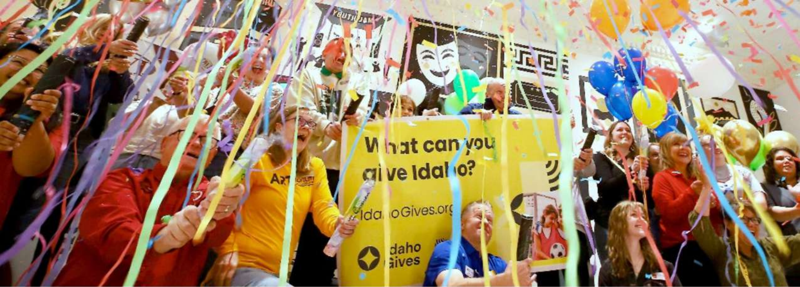
Pictured: Idaho Gives Celebration 2024