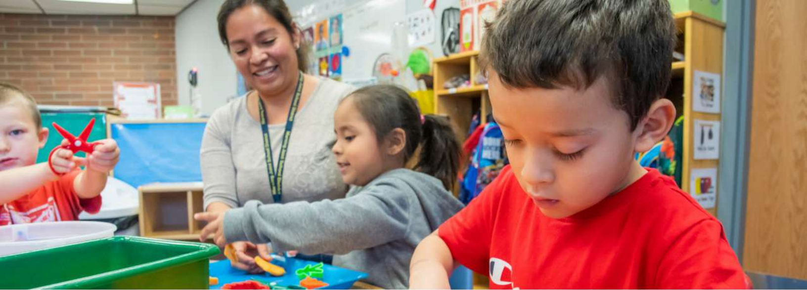
Pictured: Marsing Community School