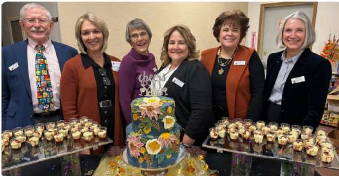
Pictured: Grangeville Community Foundation 2022 Board