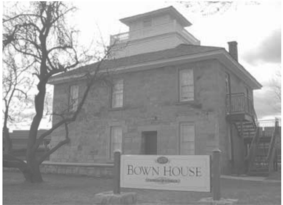
The Bown House, built near Boise in 1879, provides a glimpse into history through its heritage education project, funded by the J.A. and Kathryn Albertson Education Fund in the Idaho Community Foundation.

Caribou County Healthier Youth, Inc. , Soda Springs, $2,200 to help promote youth assets and asset building. (c)