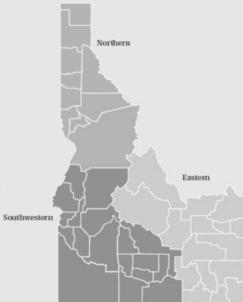
REGIONS OF THE IDAHO COMMUNITY FOUNDATION

The objective of the Total Return Concept is to allow the Foundation to be responsive to current needs while maintaining the purchasing power and grantmaking capacity of its endowment over the long term.