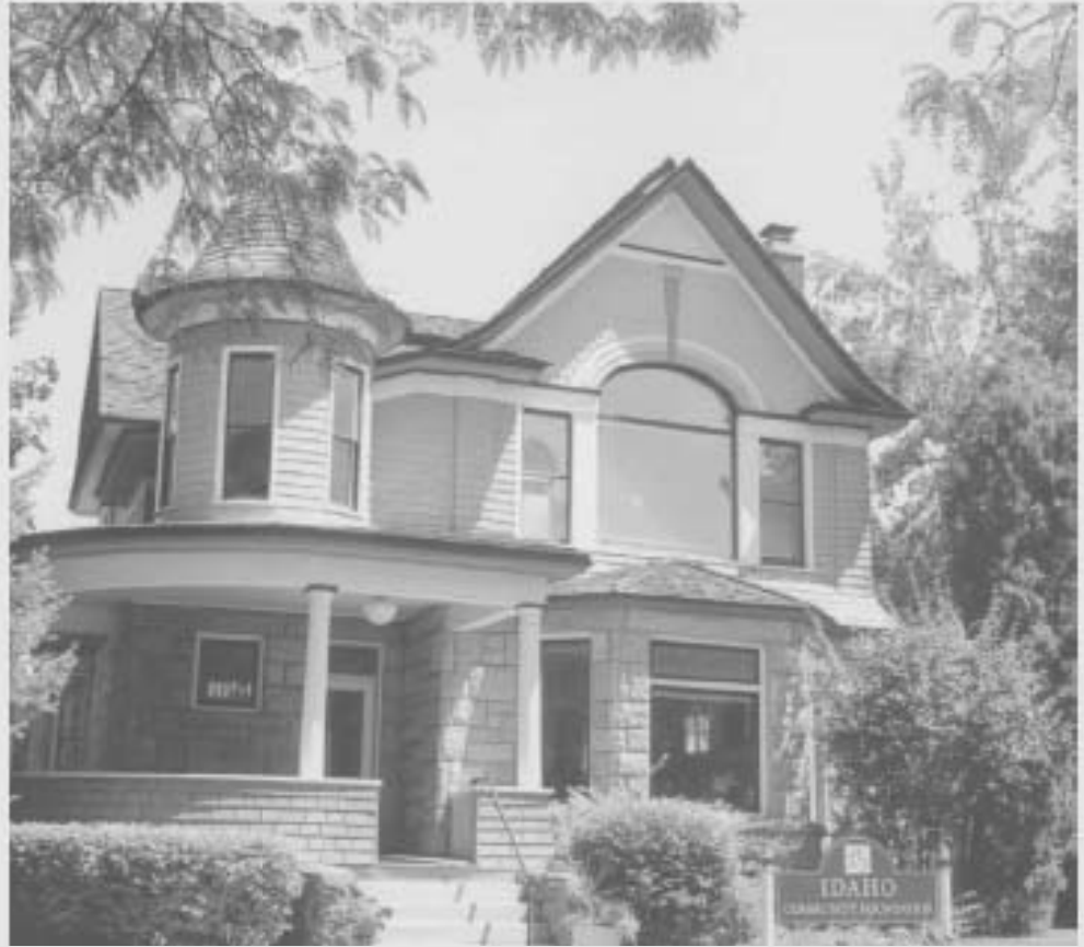
The Idaho Community Foundation office at 210 West State Street in Boise

Total assets of the Foundation at year-end 2002 were $40.6 million. Endowment was $34.8 million. The difference between total assets and total endowment is comprised mainly of special project funds and philanthropic gift funds which may be fully expended and therefore are conservatively invested.