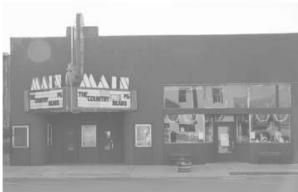
The historic Mackay Theater/Soda Shoppe has a new roof thanks to the efforts of the Mackay Cultural and Arts Council and support from ICF's Steele-Reese Foundation Fund. It is the only theater for 150 miles.

United Way of Kootenai County, Inc., Coeur d'Alene , $500 for general support. (d)