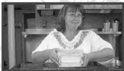
Buhl Senior Center Meals on Wheels

James E. Hawkins Memorial Scholarship Fund Joe and Celeste Miller Family Fund John William Jackson Philanthropic Gift Fund Jon and Mimi Barnes Philanthropic Gift Fund Just Family Foundation Kalange Family PG Fund Kissler Family Foundation Philanthropic Gift Fund Larry and Ilene Leisure Philanthropic Gift Fund Macedonian Trust Main Street Mile Men's Health Fund Marshall Family Fund Mary & George Freund Philanthropic Gift Fund Merina Healing Arts Foundation Nampa Industrial Corporation Scholarship Fund North Idaho Family Literacy Projects Fund Old Church Operating Fund Pacific Coast Building Products Philanthropic Gift Fund Pat and Lisa McMurray Family Fund Paul C. Rebholz Memorial Gift Fund Reel Recovery of Idaho Fund Richard and JoAnn Bennett Family Foundation Roger A. and Sharon M. Nelson Charitable Foundation Fund ROK: Recreational Opportunities for Kids Rolphe Family Fund The Emmett Public School Foundation Fund The Lindsey Family Philanthropic Gift Fund The Marc E. and Nancy Sue Wallace Fund The W. E. Sullivan Fund Tom and Alice Hennessey Philanthropic Gift Fund United Heritage Fund Urquidí-Laidlaw Gift Fund Wattis Dumke Foundation Philanthropic Gift Fund Women's Gift Alliance Administrative Fund Women's Gift Alliance Fund Women's Gift Alliance Members' Fund Wood River Women's Charitable Foundation Administration Fund Wood River Women's Charitable Foundation Fund Wood River Women's Charitable Foundation Member's Fund Zane Martin Fund